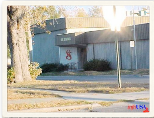
Sokol Hall and Gymnasium